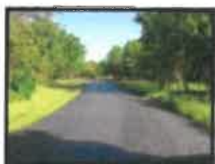
Private Roads May Be Paved or Unpaved

In some cases, these maintenance responsibilities are beyond the capacity of the owner or owners to handle. Onslow County officials are frequently asked about alternatives to maintaining private roads. As a result, the County has produced this brochure that describes maintenance options available to private road owners.